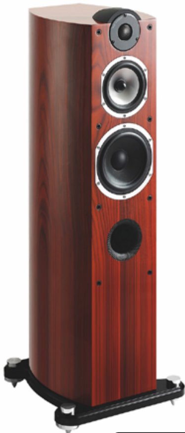
Platinum F-100 SE

Floorstanding models: The height excluding spikes and including a base. The weight including a base.