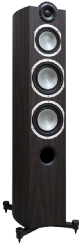
Platinum F-100 v.3