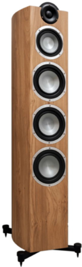
Platinum F-120 v.3

The dimensions and weights: Floorstanding models: including the grill, feet and spikes. Other models: including the grill.