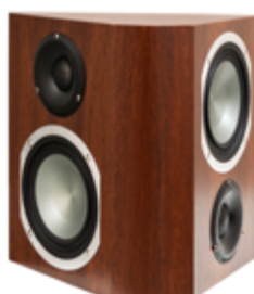
Platinum S-100 v.3