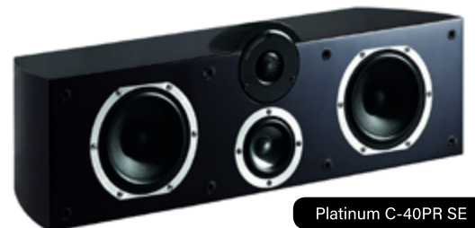
Platinum C-40PR SE