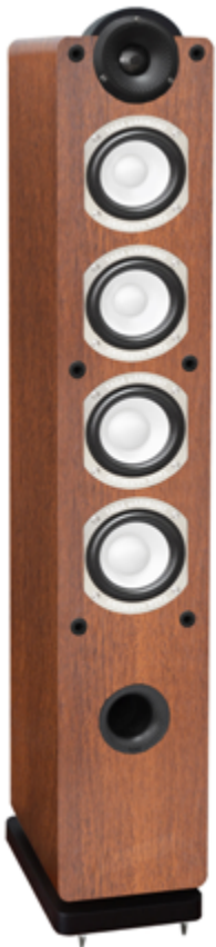
Platinum F-60 SL