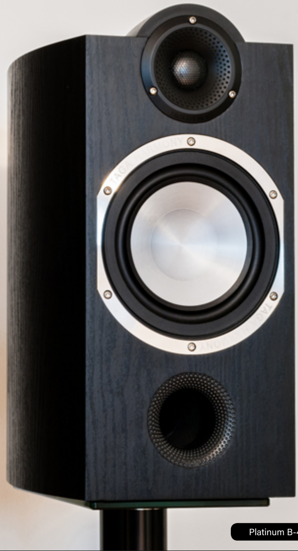
Platinum B-40 v.3

„Born in Europe - Crafted for the World” slogan is a very serious commitment and we treat it that way. That is why all of us at TAGA Harmony were engaged in creating this series - we focused mostly on intensive listening tests and sound adjustments rather than on creating perfect specifications on paper because music and generally sound is about feelings and passion.