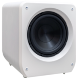
Platinum SW-10 v.3