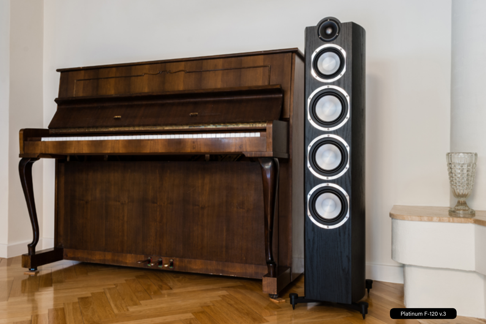
Platinum F-120 v.3