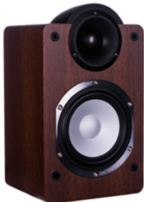
Platinum S-90 SL