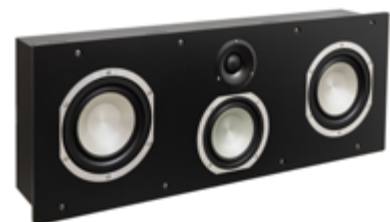
Platinum IW-100 LRCS