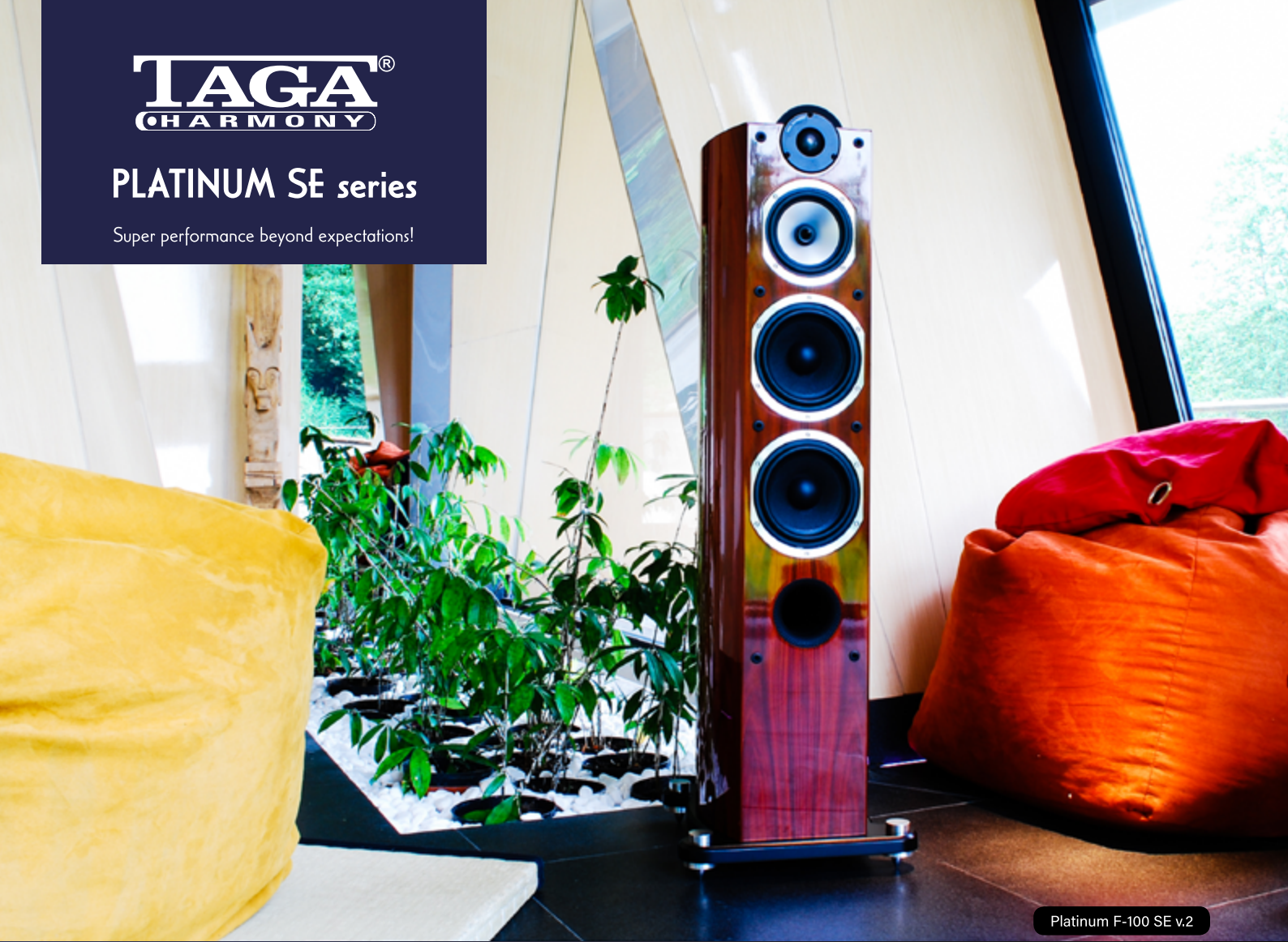
Platinum F-100 SE v.2

The award-winning and highly acclaimed Platinum v.2 series is the progenitor of our flagship Special Edition SE series. But the similarities between the SE series and the Platinum series are only the shapes of the enclosures. The High class finishes, all components and technology are totally new or deeply revised.