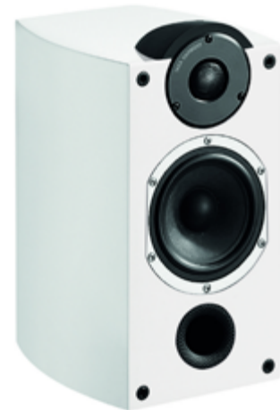
Platinum S-40 SE