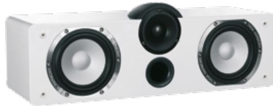
Platinum C-90 SL