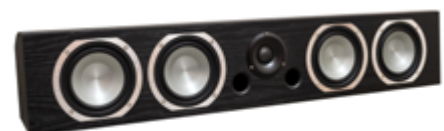
Platinum C-100 v.3