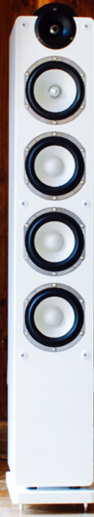
Platinum F-90 SL

You love the excellent sound of our award-winning and highly acclaimed Platinum series but your spouse would be furious seeing big boxes in your living room. Here comes the solution! The solution means no substitutions or compromises were used but just like in an old good movie: the Platinum series has just been shrunk to more compact, appealing SLIM version.