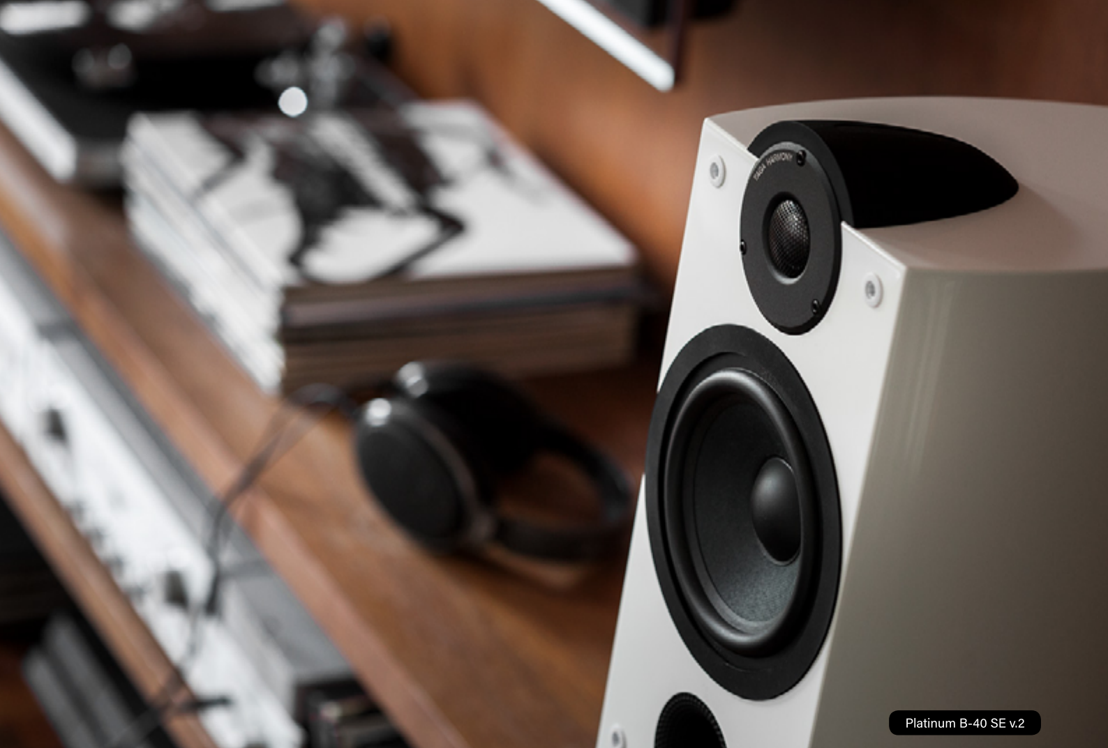
Platinum B-40 SE v.2