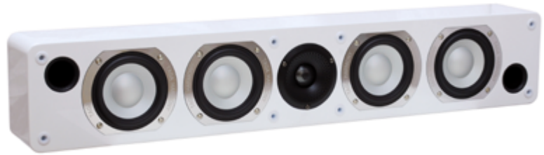
Platinum LCR-60 SL

Floorstanding models: The height excluding spikes and including a base. The weight including a base.