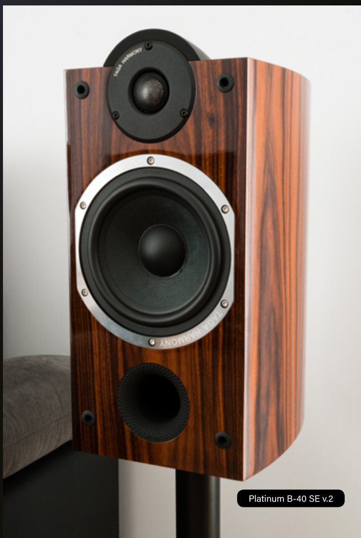
Platinum B-40 SE v.2