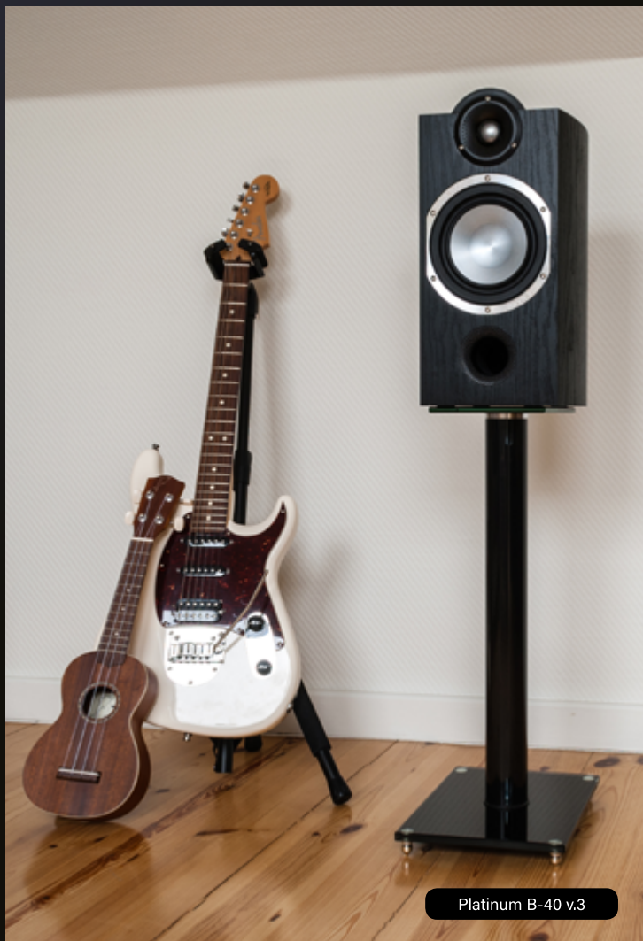
Platinum B-40 v.3

2017-2018 AV TOP 100! Best Buy Award 优秀器材推荐榜