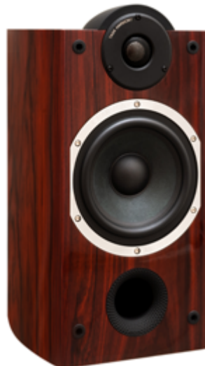
Platinum B-40 SE v.2